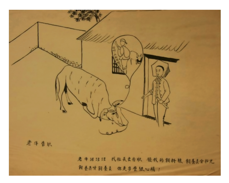
Fig. 1. Zhang Yourong, Zhang Kaiyang. "Old Yellow Bull Moan"

held in the National Art Museum of China (Zhongguo Meishuguan 中國 美術館) in Beijing [6].