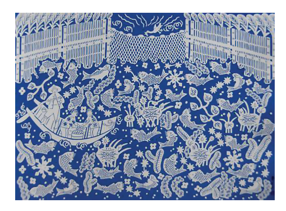
Fig. 4. Cao Jinying. "Fish Pond"

A significant role in Jinshan style shaping was played by a female artist Zhang Xinying (張新英, b. 1933), the wife of Wu Tongzhang. Together, they have also become the first researchers of local nongminhua .