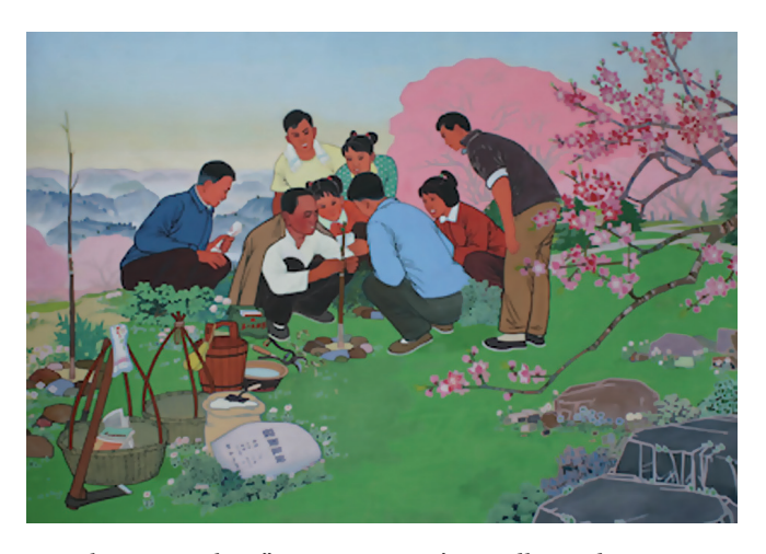
Fig. 3. Unknown Author ."Our Commune's Noodle Production Factory"